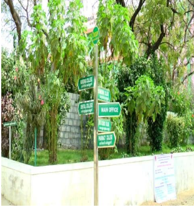
SIGN BOARD ARTS AND SCIENCE